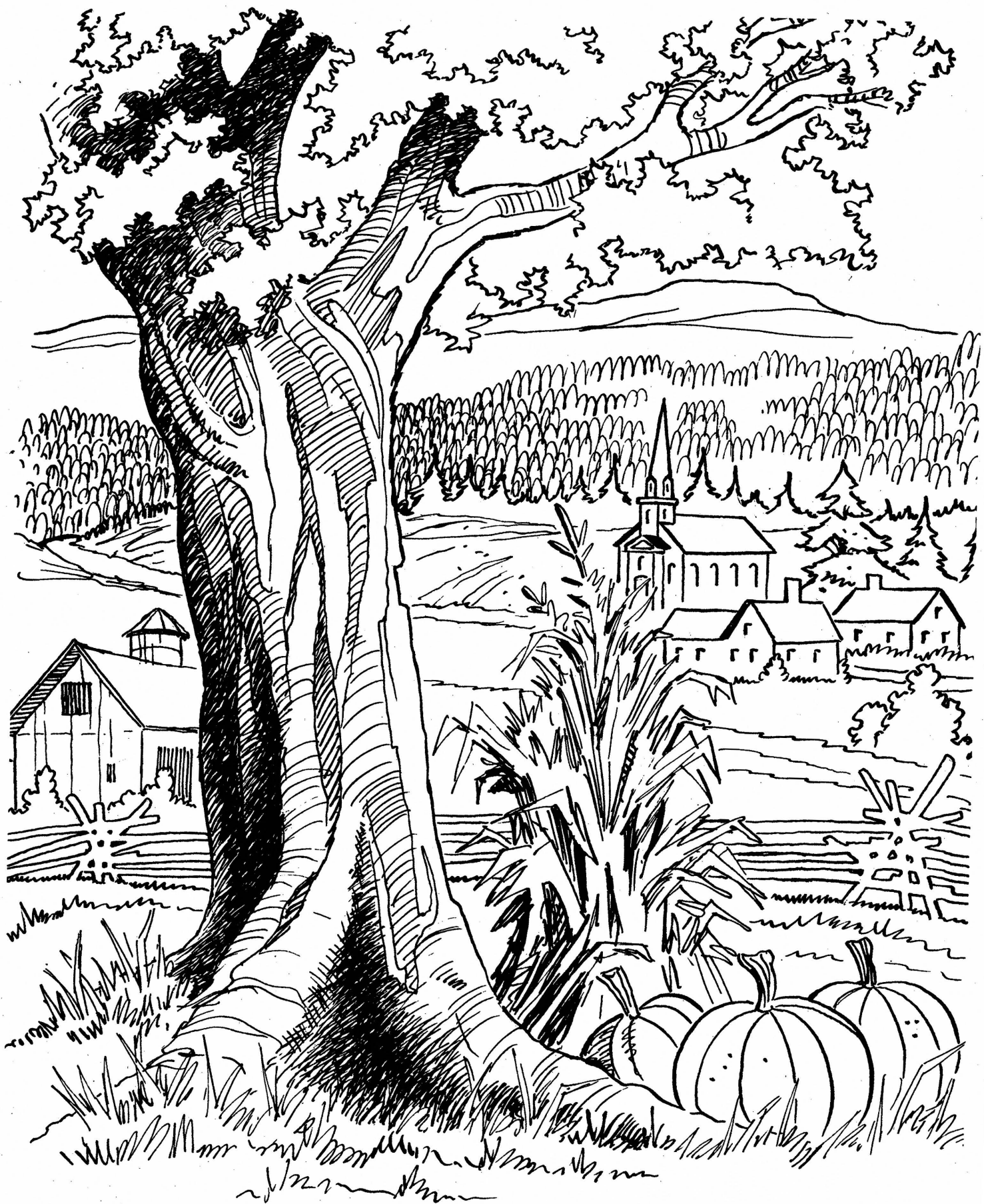
Its Autumn and the hills are alive with color