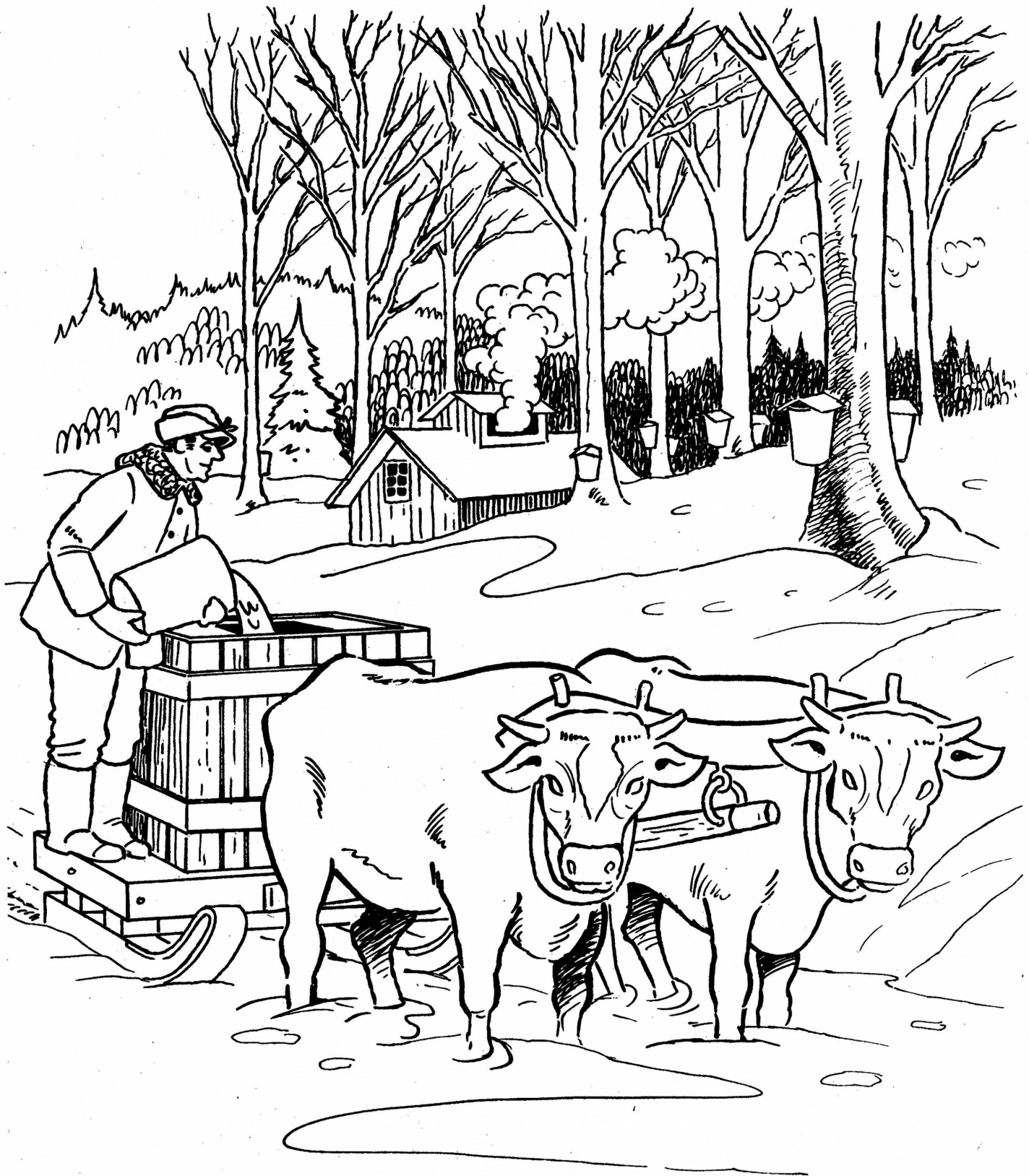
A familiar scene in the Spring, gathering Maple sap in the sugarwoods.